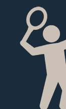
Tennis and Padel