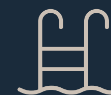
Outdoor & Indoor Pools