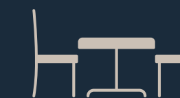
Cafes & Restaurants