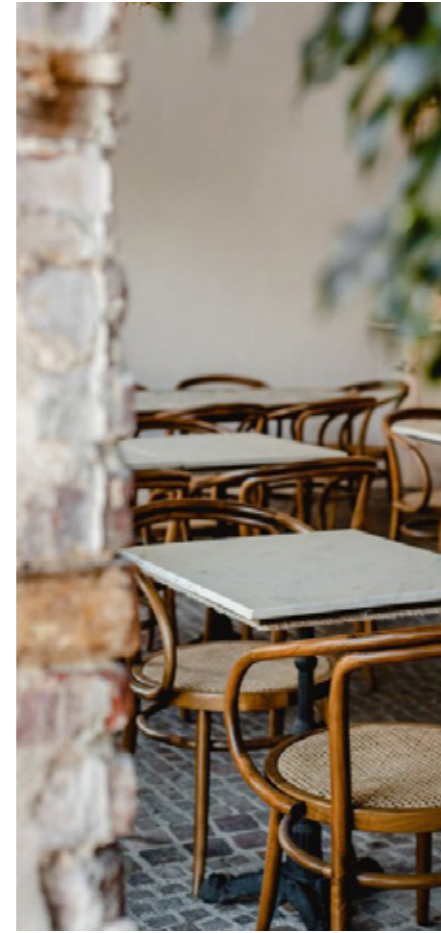
THE NAIA WALK