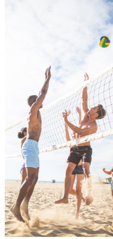
BEACH VOLLEYBALL COURT